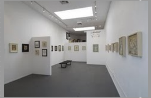
Interior shot of Thinkspace Gallery

awareness and collector base necessary for long-term growth.